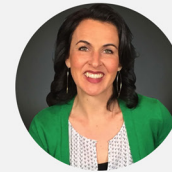
Katy Faust Them Before Us